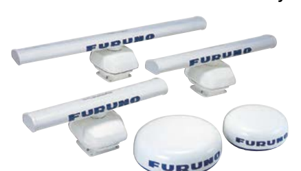
NavNet 3D DRS Antenna