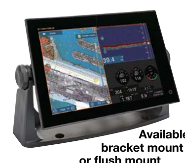
Available as bracket mount or flush mount