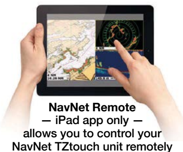
NavNet Remote — iPad app only — allows you to control your NavNet TZtouch unit remotely