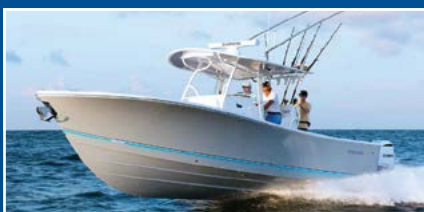
REGULATOR 31', TWIN 300HP YAMAHAS, W/HELMMASTER & SETPOINT, T-TOP, SIDE DOOR, GARMIN ELECTRONICS, ASKING 309K