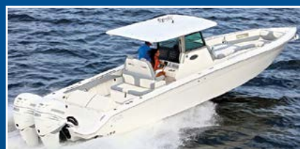
2019 MARLAGO 37SS, TWIN 350HP MERCURY, T-TOP, CABIN, A/C, SUPER STEREO, TWO-TONE INTERIOR, ASKING 289K