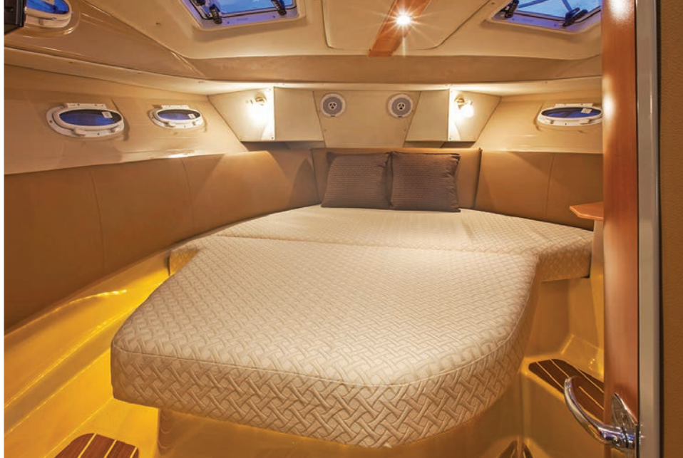
Clockwise from left: The head compartment includes a special shower enclosure; dinette converts for additional overnight guests; main cabin queen berth; fold-down countertop conceals cooktop and sink; well-equipped helm

two at the dinette and the other four guests in two cabins. The guest cabin is located under the settee in the pilothouse and features a double bed and two portholes, while the forward stateroom is accessed by a set of steps to port of the helm and includes a queen bed, five windows, two overhead deck hatches, and a storage locker. The boat's single bathroom is just aft off the stateroom and includes a cleverly designed shower area that can be closed off using a circular clear enclosure to keep water from spraying all over the bathroom interior.